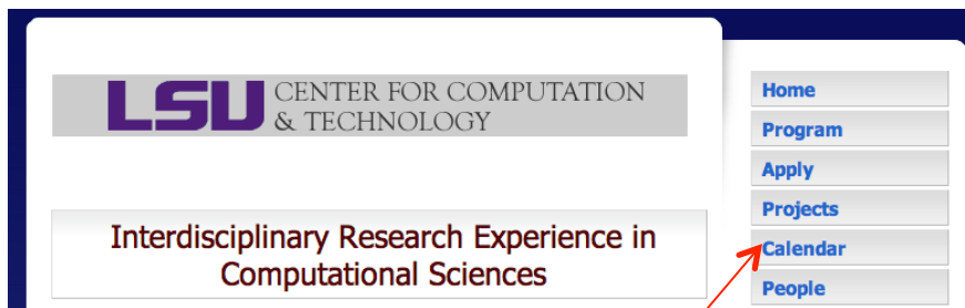
REU Calendar of Events