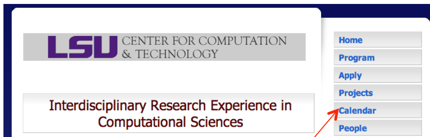
REU Calendar of Events