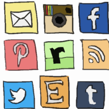
Figure 2: Many social media platforms by Unknown Author is licensed under CC BY-SA-NC